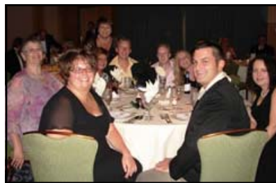
Photo from last year's conference in New Orleans

More information regarding conference details will be coming out in the next month & registration will start soon.